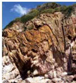
3 Beaches Walk

A walk to be enjoyed at low tide. From the mouth of the Betka River, turn right and follow the beach to a small rocky headland. Cross over the neck onto a second beach. Walk along this beach and enjoy the magnificent rock formations until you reach the end, where you once again cross over a small rocky headland onto the third beach where you will find stunning pink 'cathedral-like' cliffs. To return, retrace your steps.