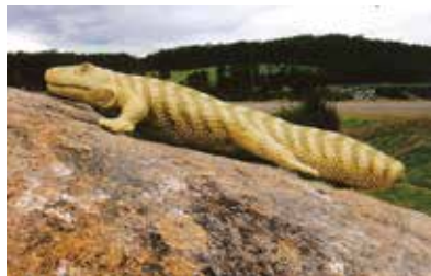
Model of Genoa River Tetrapod adjacent to the Genoa River foot bridge

The Genoa River cuts through the sediments of an ancient fresh water lake. In the late Devonian period, floods and sediments covered and preserved not only primitive plants but also the footprints of a tetrapod (an amphibious creature like a walking fish) which were identified by J.W. Warren and N.A. Wakefield in 1972. The tetrapod may have been one of the first animals to make the transition from an aquatic environment to a terrestrial one.