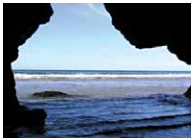
View from within cave

From Quarry Beach, return to the Old Coast Rd and turn left over the bridge. Proceed along this road to the parking area for Secret Beach. From here, there is a path and a set of steps down to Secret Beach, where good seascapes may be seen. There is a sea cave at the northern end of the beach, which you may be able to enter at low tide , watch your head as there is a rough rock overhead near the entrance.