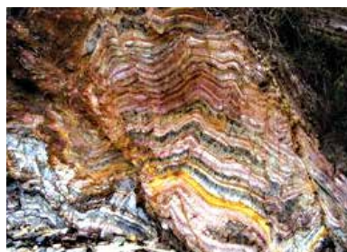
Rock strata Quarry Beach

Continue along Betka Rd past the airfield. (The road is gravel and often has potholes, take care) . The road is now the Old Coast Rd. Just before a steel and concrete bridge, there is a signed turnoff to Quarry Beach. Pleasant seascapes are evident from the parking area, but the real feature is to be found about 70m to the left along the beach where an excellent example of folded and faulted colourful rock strata may be seen. (refer geology page 4-5)