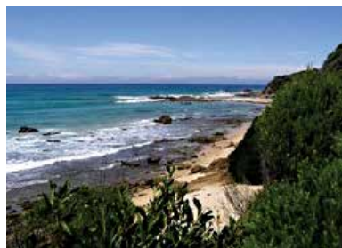
Bastion Point Lookouts

Proceed along Maurice Ave. to the roundabout and then along Betka Rd to Bastion Point Rd. Turn left and travel to the Lookouts. From these, there are excellent views of the entrance, Bastion Point, Gabo Island, Big Beach, Tullaberga Island and the Howe Range. You may access the supervised swimming beach (Summer School Holidays) from the first lookout, the second provides access to Bastion Point rock pools. Around the point is a stretch of beach which extends to Betka Beach. (This is part of the Town Beach Walk see page 9)