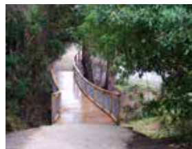
Shady Gully rainforest

J1) Shady Gully Walk: (0.6km) (Map1 E8 to C8) This walk passes through a dry sclerophyll forest of Mountain Grey Gum, Angophora and Stringy Bark and a remnant rainforest. Interpretive boards outline fauna and flora species of the area. A picnic table offers the opportunity for solitude.