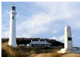
Point Hicks Lightstation & memorial

AN) Boyd's Tower and Davidson Whaling Station Historic Site: Access to these two historic sites is via Edrom Rd which turns off the Princes Hwy 43km north of Genoa. Apart from the historical aspects (well explained on information boards), the seascapes at the headland where Boyd's Tower is located are superb. On the southern side of the headland is a very interesting rock formation (an interpretive board explains the formation).