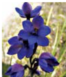
Dotted Sun Orchid

T2) Shipwreck Creek to Seal Creek Walk: (Approximately 6km return) The track has recently been upgraded. It is accessed from the south western side of Shipwreck Creek Beach. The track leads to the secluded Seal Creek Beach where there are impressive rock pools to explore. Approximately three quarters of the way along a sign indicates a path parallel to the creek down to the beach. Return by the same route.