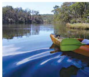
Canoeing Sou'West Arm

Return to the Genoa Road, turn right and travel approximately 2km to Sou' West Arm Track. Follow this track to the Sou' West Arm picnic ground (Map 2 B5); the jetty is a short walk from the parking bay and an extension of the track gives access to another scenic point. Return to the Genoa Road, turn right and travel approximately 3km to the Genoa Fire Trail. This 4WD track leads to a short path to a picnic ground and jetty on the Genoa River (Map 2 B4). Return to the Genoa Road, turn right and travel to the Gypsy Point Road. Proceed to Gypsy Point (Map 2 A2). Also investigate the Genoa River from the end of View Street.