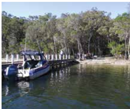
Cemetery Bight Jetty

V2) Allan Head to Cemetery Bight: (2km one way) (Map 2 H5 to I4) The track from Allan Head Picnic area follows the shore line before rising to an old bush cemetery where some early pioneers of the district are buried. Only one grave is now marked, the rest having been obscured by fire and time. It is a short walk down to the beach at Cemetery Bight.